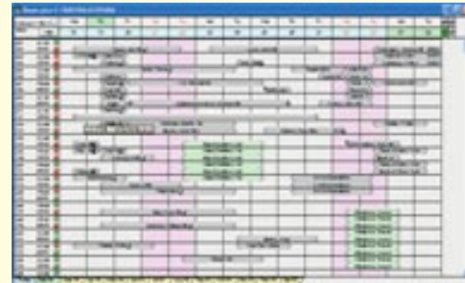
1 Active room schedule

Our protel smart solution gives you tried and proven technology that is simple to implement. In addition, you benefit from more than ten years of experience possessed by a leading developer and supplier of high-quality hotel trade software.